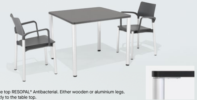
Arn tables: table top RESOPAL® Antibacterial. Either wooden or aluminium legs. Screwed directly to the table top.

Surfaces chosen as to provide the least possible adhesion to germs, microbes and mildew